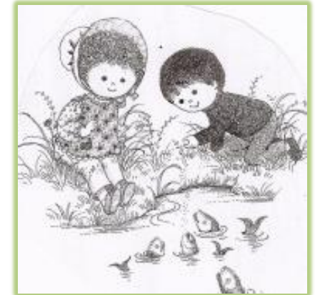
I love the nature!