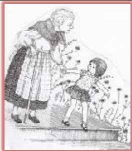
helpful and kind