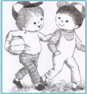
a great friend