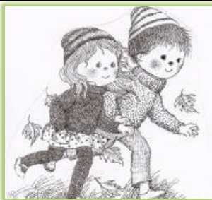
beautiful and strong