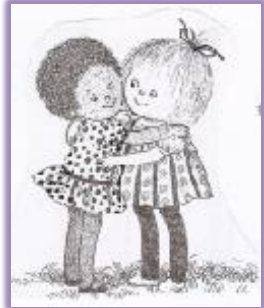
a great friend