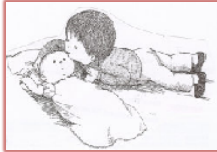
loving and affectionate